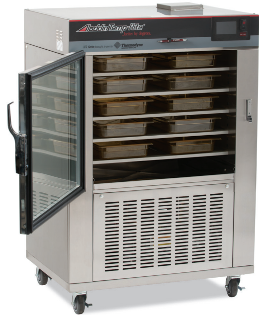
Model R2D2005 Shown.

These conduction units control food temperatures with specially designed fluid filled shelving. When bulk food is loaded into the units, the temperature of the fluid inside the shelving remains low, keeping foods chilled until the pre-programmed time of your choice. At that point, the same fluid is quickly heated, warming food to a precise serving temperature as it circulates within each shelf. After rethermalization is complete, the unit enters a holding cycle to maintain food quality and temperature until it is ready to be served.